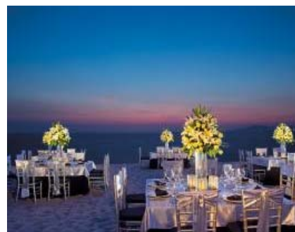
Now Amber Puerto Vallarta

What You Get All meals and nibbles at seven restaurants, 24-hour room service and unlimited top-shelf liquor at five bars — one of which is swim-up — are part of the package. Three pools, an ocean trampoline, beach movie nights, dance lessons, yoga, games and sports such as kayaking and snorkeling are also included. Stay a week and celebrate with a gratis wedding package, finished off with a romantic turndown featuring a rose-petal-strewn spa tub for two, sparkling wine and chocolate-covered strawberries.