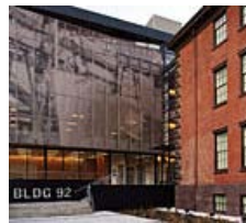
New Yorkers: 10 great NYC attractions you've probably never heard of (Time Out New York)