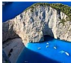
10 Most Beautiful Beaches Almost No One Knows About (Destination Seeker)