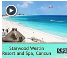
Worldwide Guide: Westin Resort and Spa...