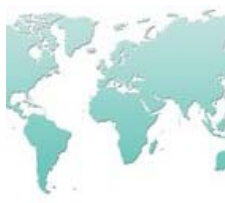
Find Your Perfect Destination Wedding or Honeymoon