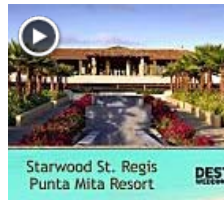
Worldwide Guide: St Regis Punta Mita